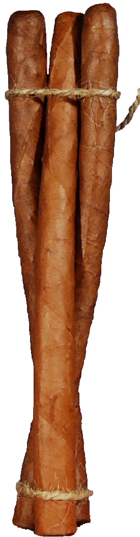
CULEBRA THREE CIGARS BRAIDED TOGETHER