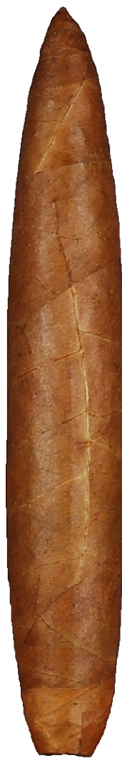
TORPEDO TAPER AT THE HEAD & FOOT - POINTY HEAD