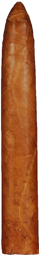
PYRAMID TAPERS TO A POINT AT THE HEAD