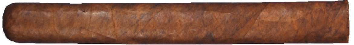
DOUBLE CORONA 7 1/2" x 50 RG