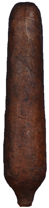
PERFECTO TAPER AT THE HEAD & FOOT - ROUNDED HEAD