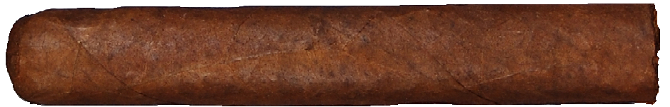
ROBUSTO EXTRA 6" x 50 RG