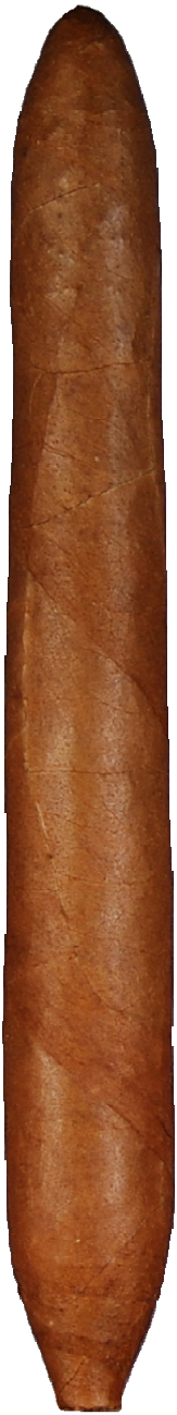
SALOMÓN TAPER AT THE HEAD & FOOT - NIPPLE FOOT